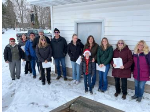
Christmas carolers to our home bound.