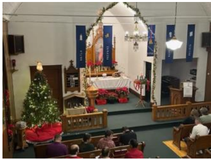
Christmas Eve Worship